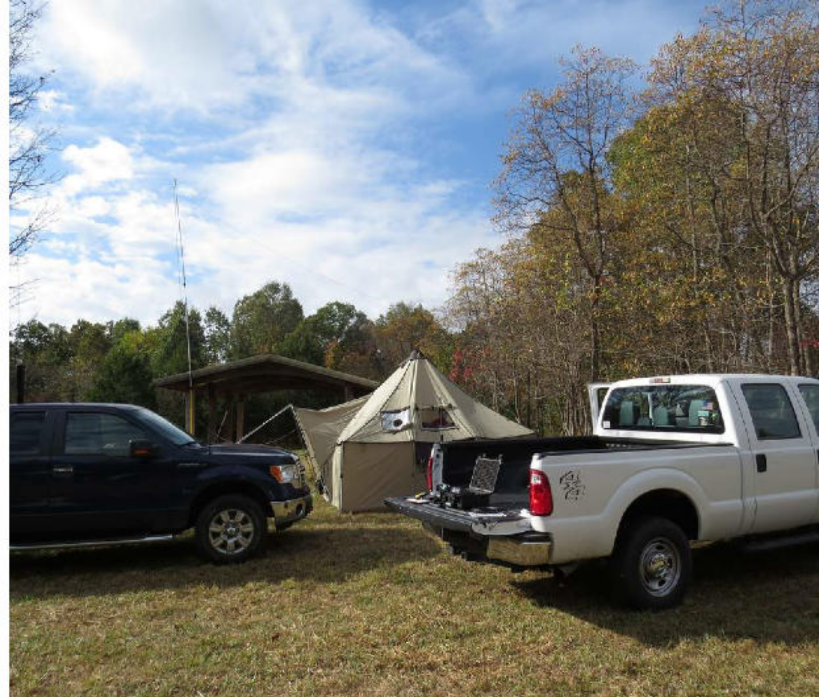
JOTA (Boy Scouts)