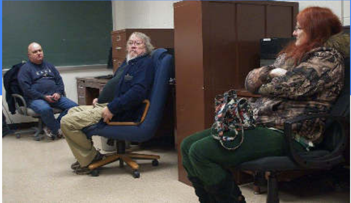
Super VE Team