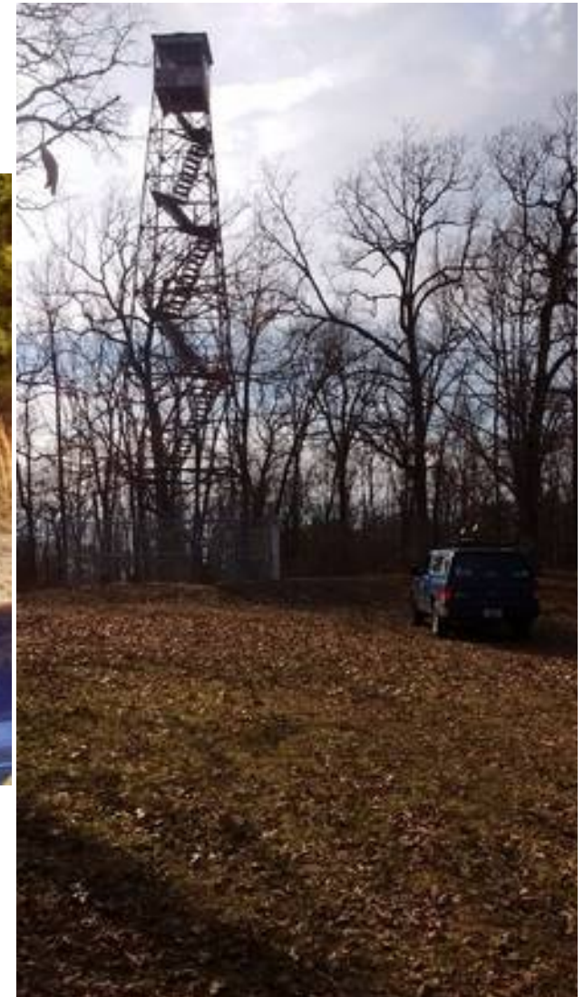
Entrance and Tower