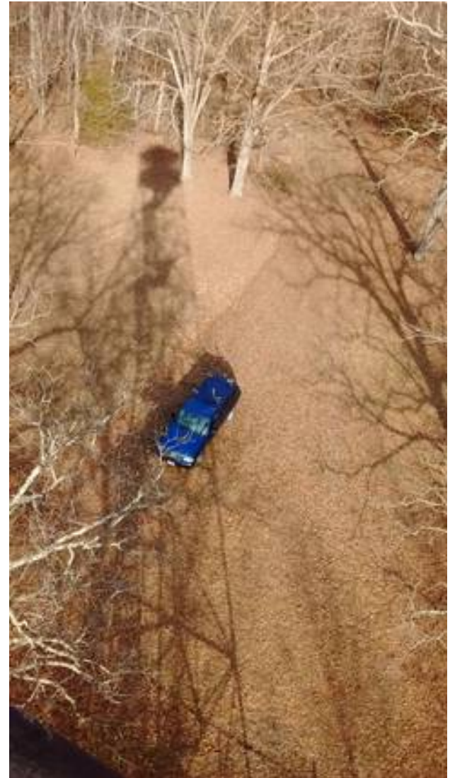
View from the top