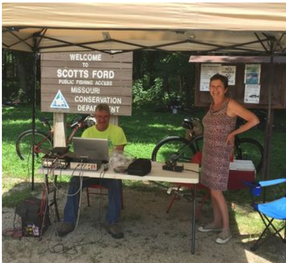
N6RHQ and KD0JNI