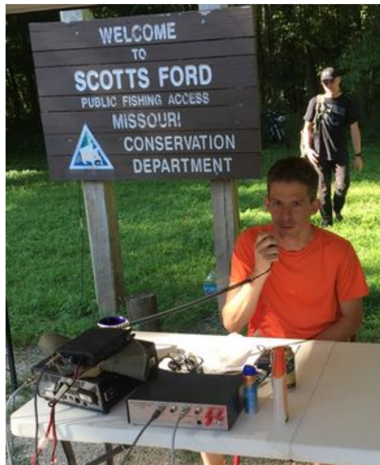
Guest Operator NA0Q