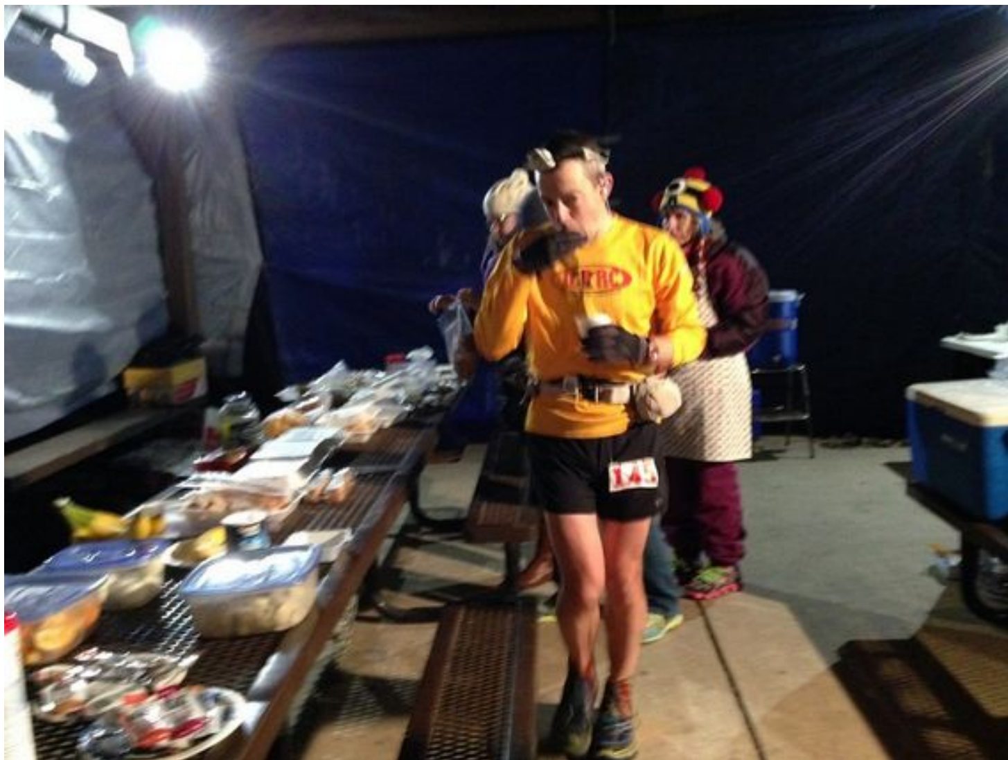
Berryman 11 refreshment & snack layout.